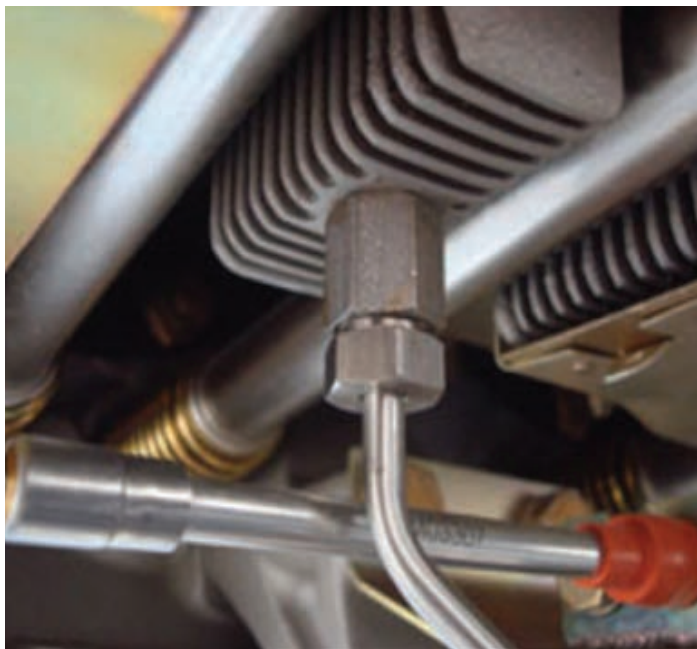
Figure 3—The CHT probes in Cirrus aircraft are notorious for failing and providing erroneous CHT data.