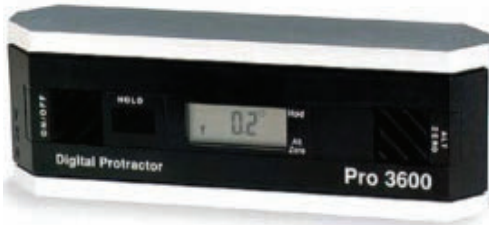
Figure 4—The $360 Pro 3600 digital inclinometer turned out to be off by 3 degrees. The old-fashioned E25 “flowerpot” timing indicator got the job done.