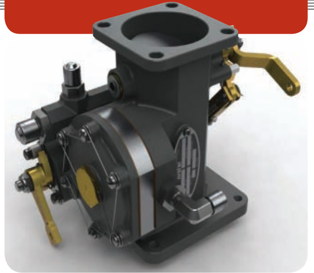
Figure 1—Two local mechanics decided that the RSA fuel servo was the culprit.