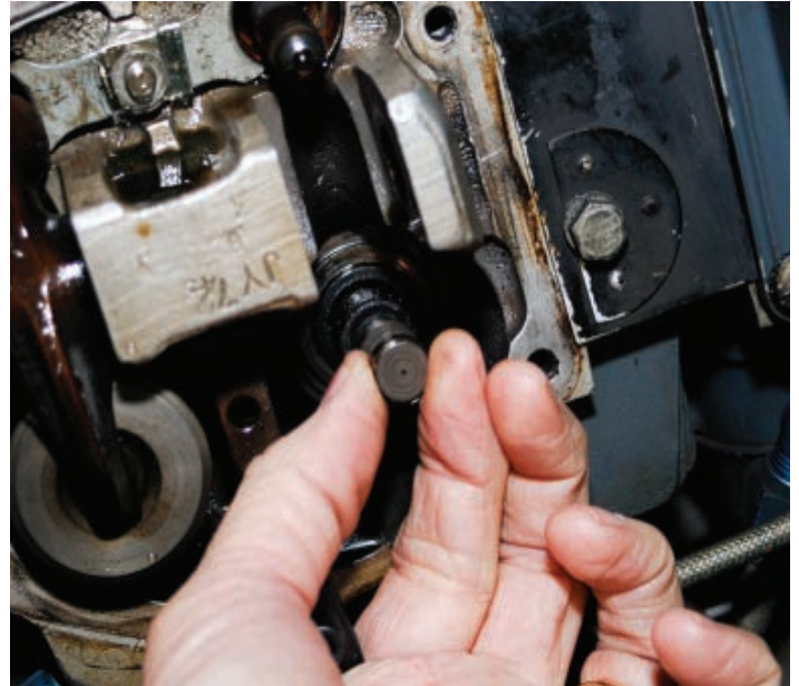
Figure 5—it makes no sense to do this sort of invasive exploratory surgery before first dumping and analyzing data from the digital engine monitor.

I compared the engine data for the last pre-annual flight to the data for the two aborted post-annual flights. What I found