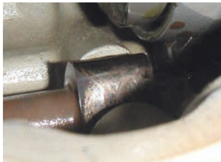
A severely spalled cam lobe. This camshaft failure originated from corrosion pitting during an eight-month period of engine disuse.

Piston and ring failures can cause catastrophic engine failures, usually involving only partial power loss but occasionally total power loss. Piston and ring failures are of two types: 1) infant-mortality failures due to improper manufacture or installation; and 2) heat-distress failures caused by pre-ignition or destructive detonation events. Heat-distress failures can be caused by contaminated fuel or improper engine operation, but they are generally unrelated to hours or years since overhaul. A digital