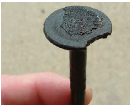
Exhaust valves often don't survive to TBO. If we don't catch a potential exhaust valve failure using compression tests, borescope inspections, and engine monitor data, we risk a total failure (“swallowed valve”).

The top-end components—pistons, cylinders, valves, etc.—are considerably less robust. (The “top end” of a piston engine is analogous to the “hot section” of a turbine