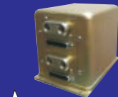
★ Dual AHRS/Air Data Computer