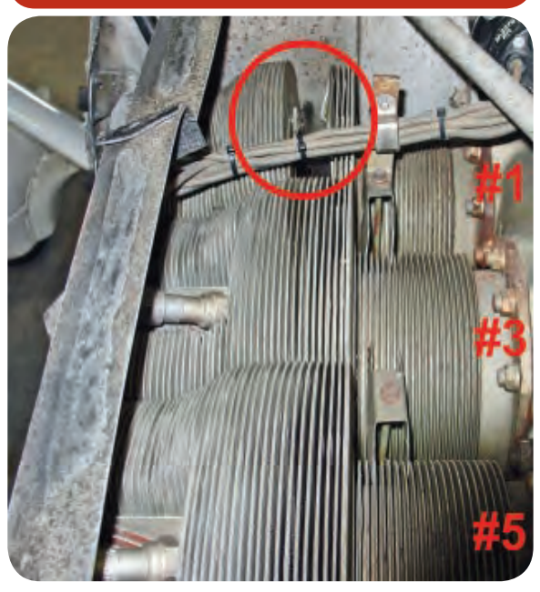
Figure 1—The No. 1 cylinder head on this TCM 0-470-U engine suffered a catastrophic fatigue failure in flight. The No. 3 cylinder suffered a similar failure about an hour later.