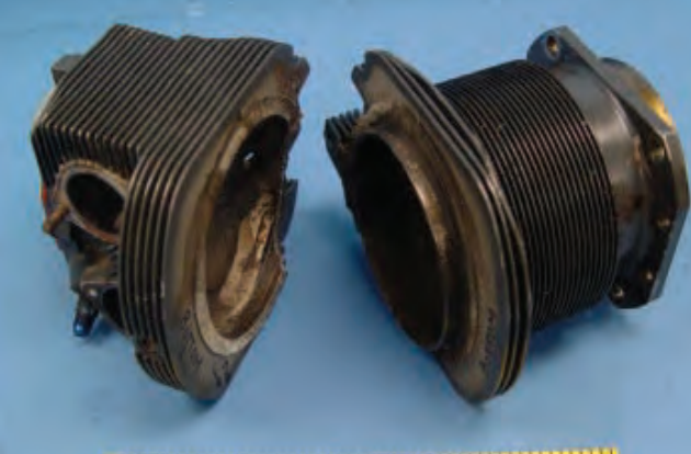
Figure 2–Head-to-barrel separations are not limited to Continental engines. Here's a Lycoming cylinder that lost its head.

Predictably, a hue and cry arose from the industry. Hundreds of comments were Figur submitted to the FAA's rulemak-Here' ing docket, almost all of them opposing adoption of the draconian proposed AD. Nevertheless, the FAA would not be deterred. On August 5, 2009, it issued the final rule on AD 2009-16-03, tolling the death knell for Superior investment-cast