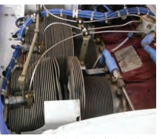
Figure 3–Head-to-barrel separation of the No. 5 cylinder on a Continental TSI0-520 engine.