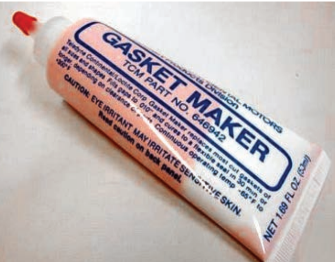
Figure 4—The TCM maintenance manual said that Gasket Maker could be used on "all uncoated oil seals." That turned out to be misleading.