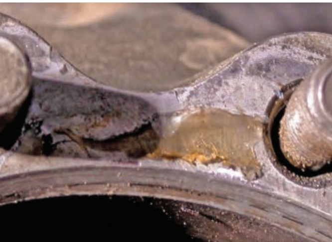
Figure 3—The “smoking gun”—sealant on the cylinder deck. But how did it get there?