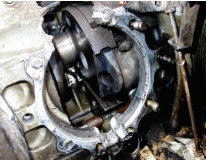
Figure 2—The NTSB examined the Debonair’s engine and found that the No. 4 cylinder and piston had departed the engine in flight.

So how the heck did the sealant get on the cylinder deck?