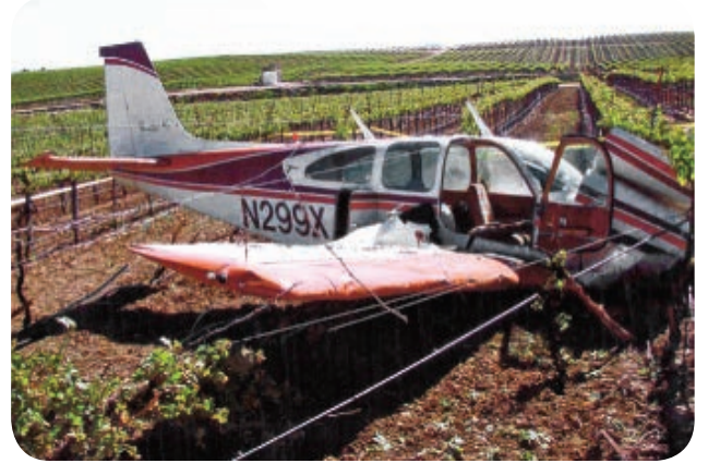
Figure 1—The Debonair made a forced landing in a vineyard 2 miles short of the Paso Robles airport. The aircraft was not equipped with shoulder harnesses, and the pilot and passenger both sustained serious head injuries.