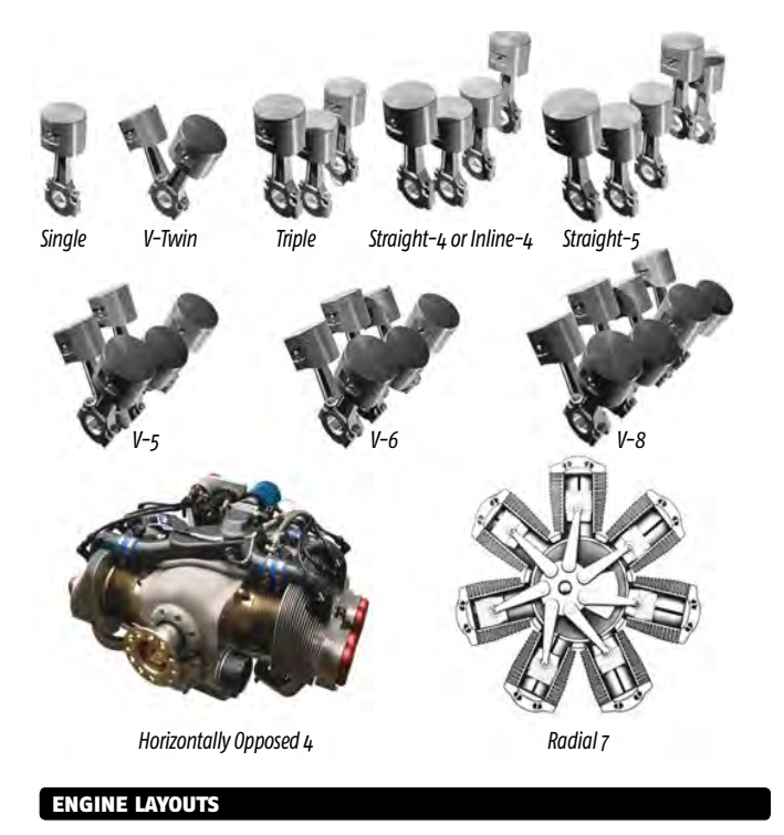
Otto-cycle engines commonly have four or more cylinders arranged so that at least one is in its power stroke at any given time.

timing relationships of piston position, pressure, temperature, valve opening and closing, and ignition. The more you understand about the combustion event and timing relationships, the better job you will be able to do of managing your powerplant, optimizing your power and mixture settings, and troubleshooting any engine problems that may arise. With that in mind, let's explore the Otto cycle a bit more deeply.